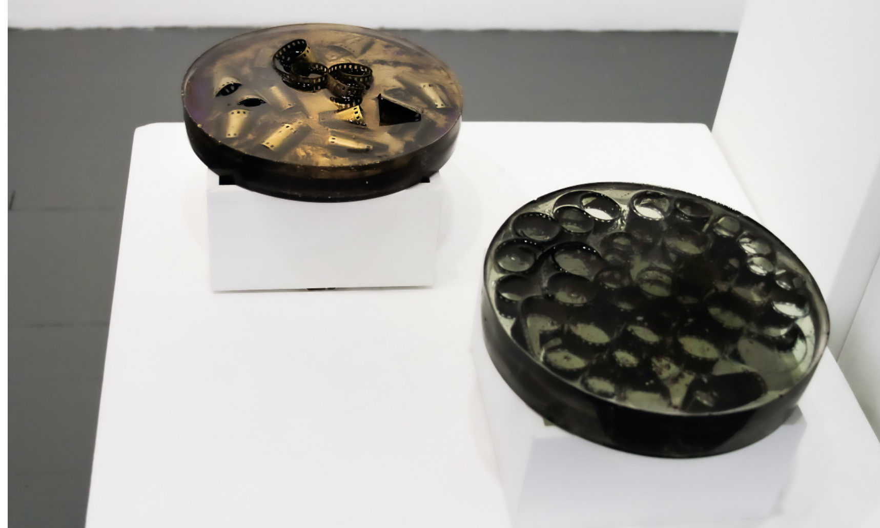
Installation view, Tulu Bayar: Traces at Amos Eno Gallery

Anchoring the space are four works which lie flat on plinths, offering the viewer the opportunity to peer down into their depths to explore Bayar's works in more detail. Here, one can appreciate the materiality present and inherent to each unique work. Layered film rolls and multicolored inks sit on top of each other with a meditative stillness, as if frozen in time. "The gestural record on the surface stages a moment of existence that is no other moment," remarks Bayar. "By containing that peculiar moment, I feel like I am able to memorialize the process."