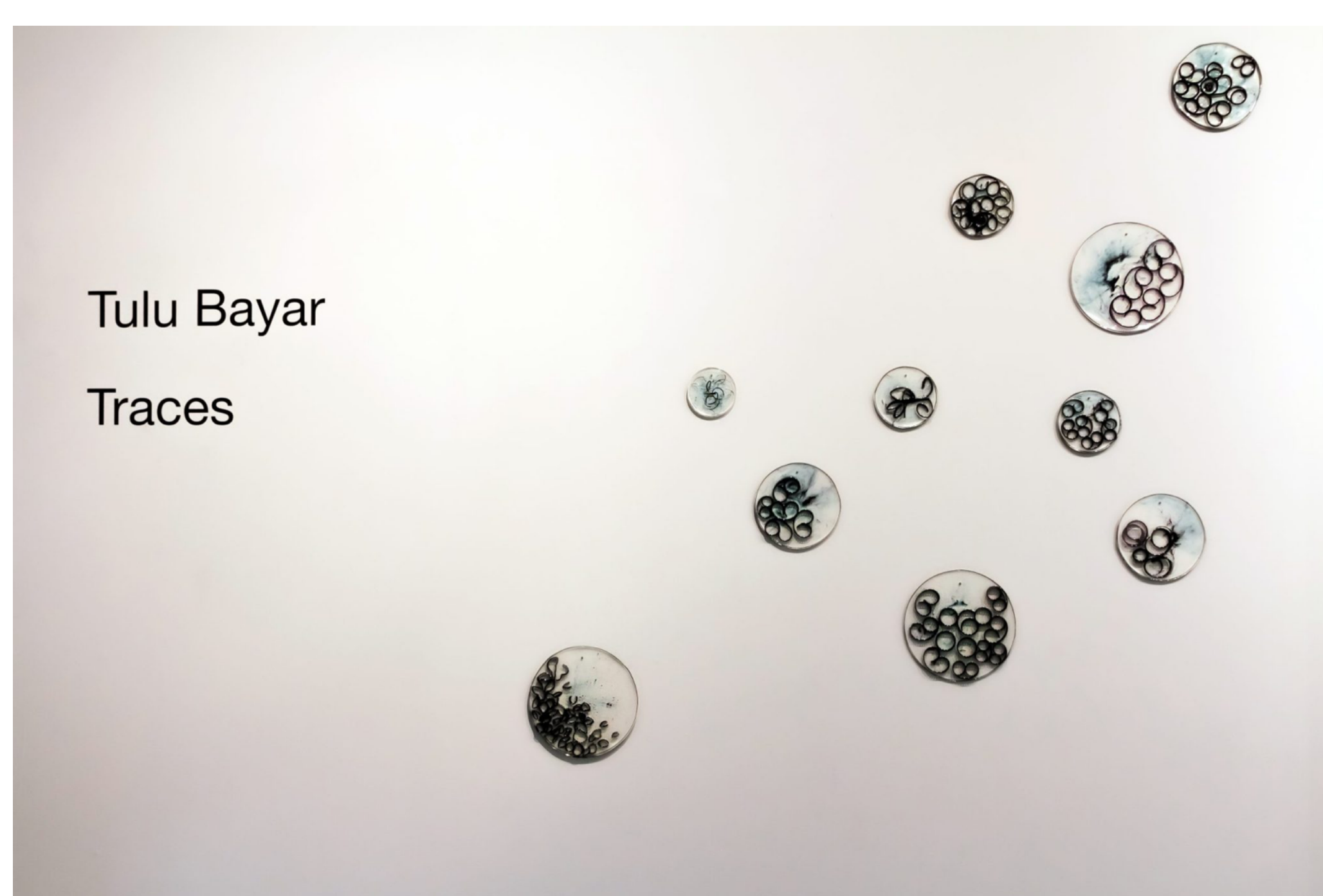
Tulu Bayar Traces

Bayar's work evokes the relationship between time and space itself. We can never fully grasp the many layered histories that shaped the world we live in today. We can only see the shape of the world.